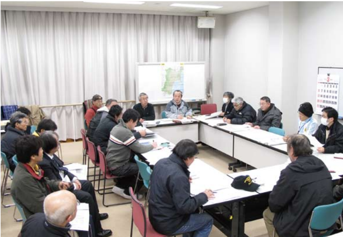
Task force created immediately after the disaster at Miyagi Co-op (photo from the 18th meeting on March 18, 2011).

minimize damage at the next earthquake and to provide more assistance to the communities, the Business Continuity Planning (BCP) must be carefully reviewed and revised at each local Co-op, co-operative union, and JCCU.