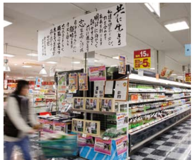
A slogan that says “Live Together” written by Miyako High School students hang inside the store of the Iwate Co-op / Marine Co-op DORA.

The disaster has made local co-op members make efforts to enhance disaster prevention awareness amongst local children. Usually, these measures involve inviting specialists to hold study meetings, but hands-on workshops that simulate evacuation routes on maps also attract the interest of many people. The people in the community should not be simply instructed, but also taught to think and judge for themselves to be truly effective in disaster preventative measures.