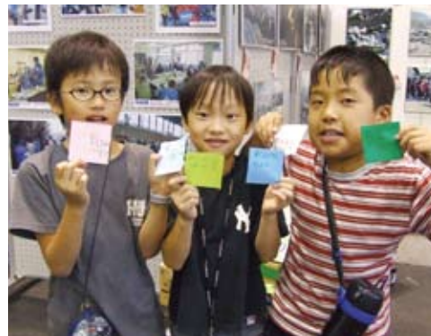
Children attending the “Happy Food 2011” event showing messages that they wrote to the people in the disaster areas.

On November 21, Co-op Net Business Association held a “Fureai Cafe” at the temporary housings in Higashi Matsushima City, Miyagi Prefecture. Children are excitedly learning to play with spinning tops under the guidance of childcare instructors.