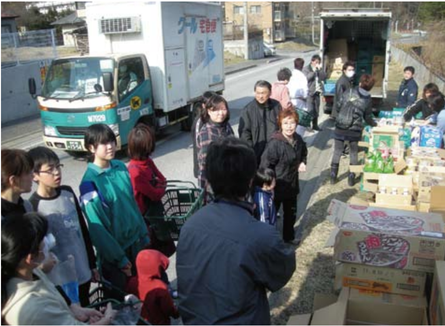
A store on wheels (moving shop) held on March 19 at Kamaishi, offering vegetables, instant noodles and articles for daily use.