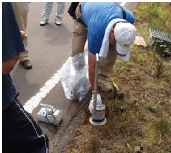
The top 2 cm of surface dirt was removed with a shovel and transported away in plastic bags.