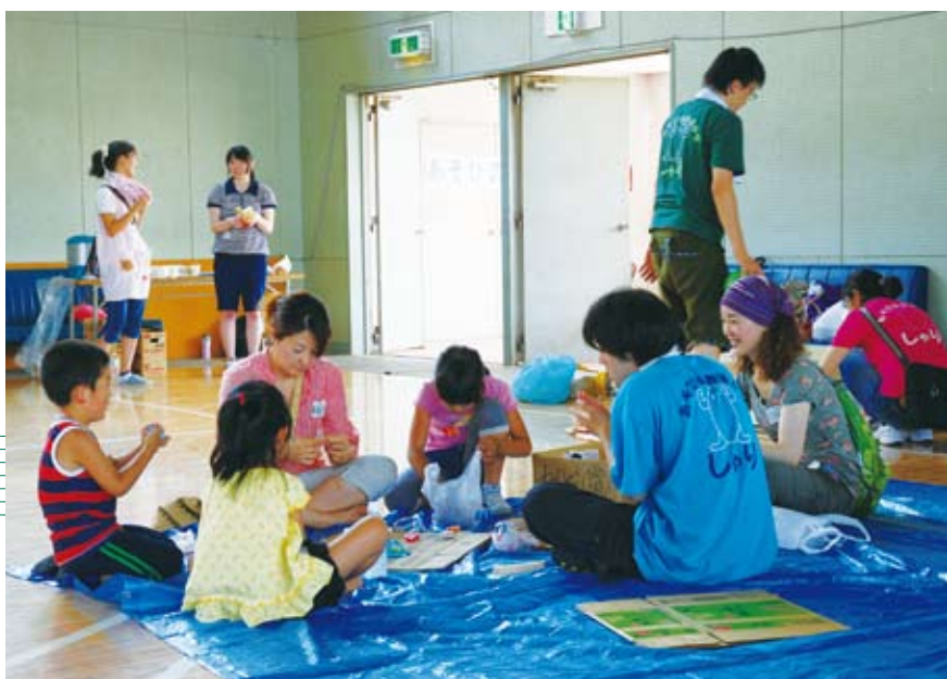
July 17, children playing with paper clay at the "Kodomo no Asobi no Hiroba (Children's Play Area)" held at the gym of the Kyu Kisai High School shelter.