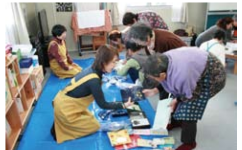
“Oyuzurikai (Giving Event)” that gives people in the disaster areas items that have been collected from the Co-op members (Miyagi Co-op).