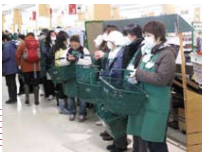
Employees of Miyagi Co-op Kunimigaoka Store escorted people one-on-one. The employees themselves were victims of the disaster, but they still strived to supply the people with products.