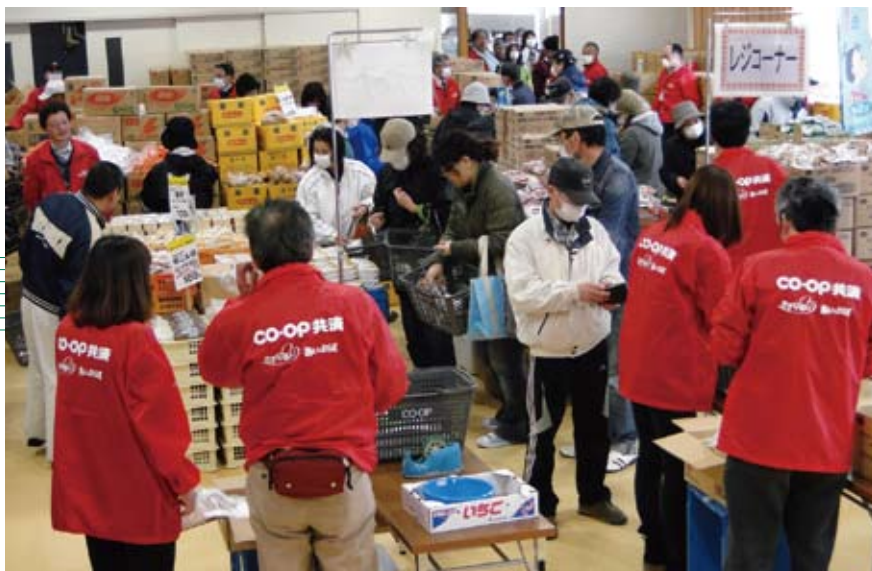
The market event offered natto, an item that was difficult to find in the city, as well as tofu, proudly made by Co-op Fukushima. A wide variety of fresh produce were also offered, which were precious at the time.