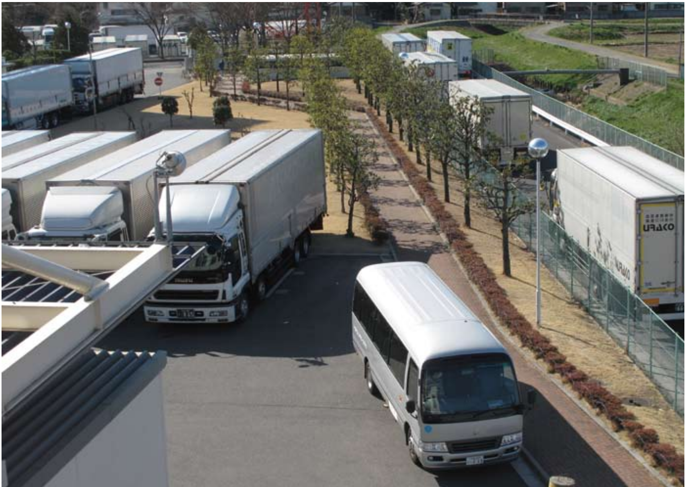
At the most in a single day, 50 trucks loaded with supplies departed for the disaster-stricken areas from the Okegawa DC of CX Cargo.

nation were placed in the disaster areas to deliver supplies from a local delivery hub to the shelters. The usual delivery system was combined with aid activities, making Co-op an invaluable presence in the disaster areas.