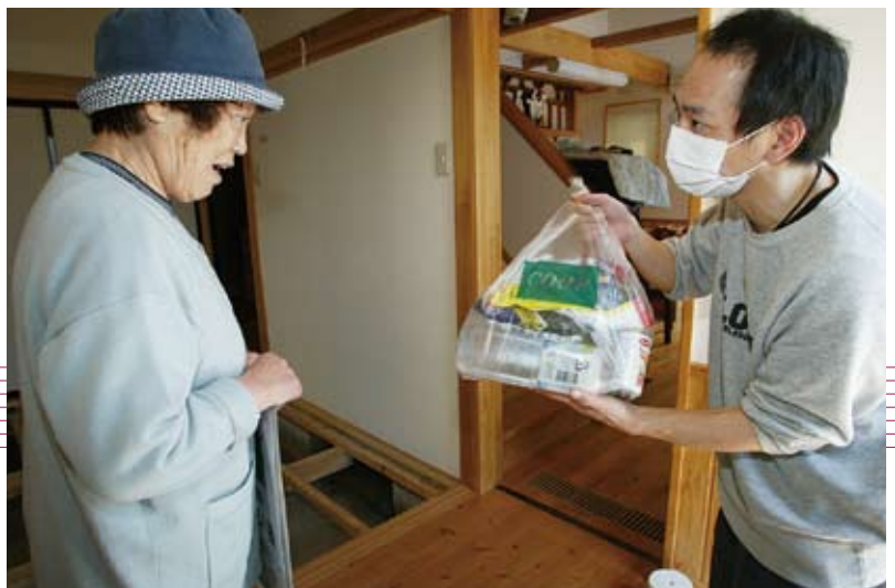
Co-op members were very happy when the home delivery services were resumed.