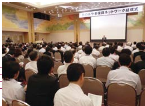
“Miyagi Food Recovery Network” held on July 2, with approximately 300 participants.