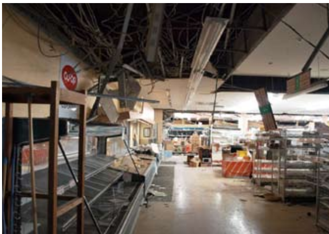
Co-op Mart Kunimi of Co-op Fukushima, with the ceiling down and the wires hanging visibly.