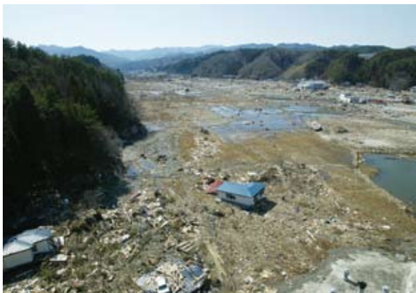
Yamada Town on the coast of Iwate prefecture, which was stricken by both the tsunami and fire.