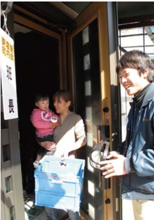
A Co-op member smiles as she receives a present distributed in a token of sympathy from the Co-op staff.