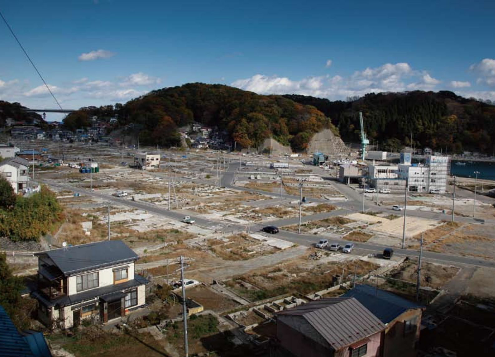
Miyako City, Iwate Prefecture in November 2011, with still a long way to go for recovery.