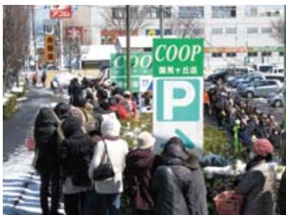
March 18, 10:00 a.m. Despite the snow from the previous day, a long line wraps around the Miyagi Co-op Kunimigaoka Store.