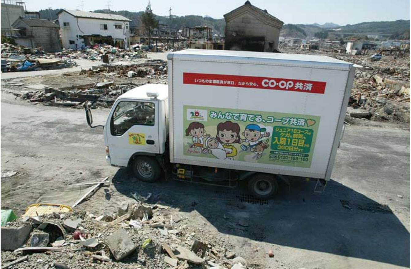
Many Co-op members said that they were cheered to see the delivery trucks running through the devastated areas.