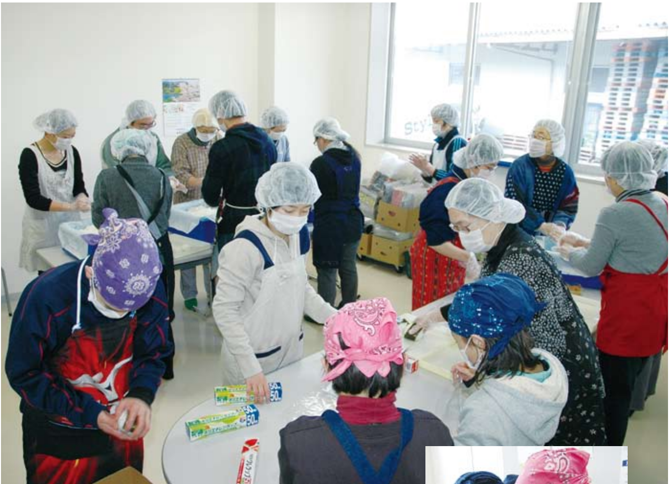
20 people, including elementary and junior high school students, worked by dividing roles into those that pick the umeboshi plums, those that shape the rice into balls, and those that wrap it with nori seaweed. (Iwate Co-op "Onigiri Team")

situation for people in the shelters. Those whose houses were spared had to walk many hours to purchase supplies, as the towns were no longer functioning, and gasoline was scarce. To support these people, local Co-ops as well as Co-ops from around the nation assembled in the disaster areas to continue providing assistance.