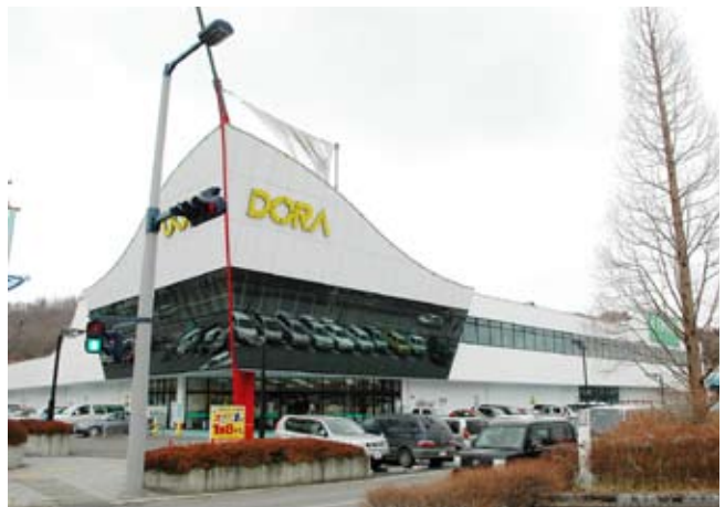
Since supermarkets near the coast were devastated, the Iwate Co-op / Marine Co-op DORA became one of the few supermarkets available to service the needs of the area.