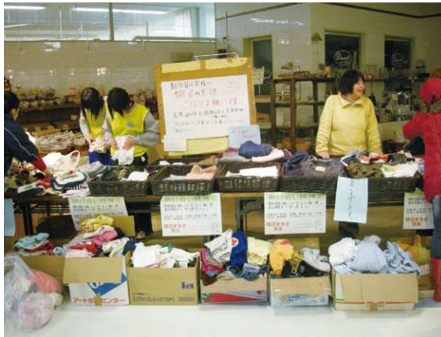
An "Exchange of Goods" corner created at a special event space in the center of Iwate Co-op / Marine Co-op DORA.