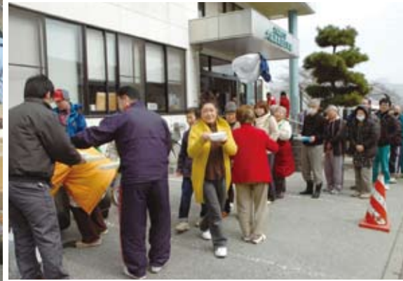
The first distribution of cooked food offered on March 20 at Ofunato Ward Community Center in Ofunato City.