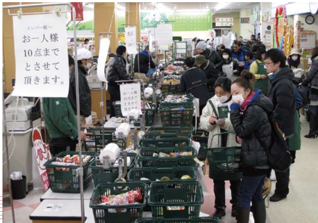
At the Miyagi Co-op Kunimigaoka Store, the number of items available for purchase per person was limited in order to distribute items to as many people as possible.