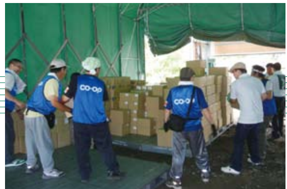
Supplies (detergents) provided by Kao Corporation, being distributed by Co-op employees together with members of the Joint Committee for Coordinating and Supporting Voluntary Disaster Relief Activities.