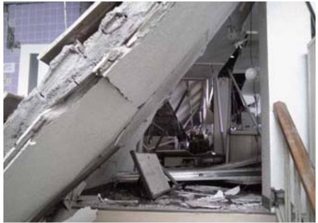
Inside the Miyagi Co-op Head Office Building "A," which was heavily damaged.