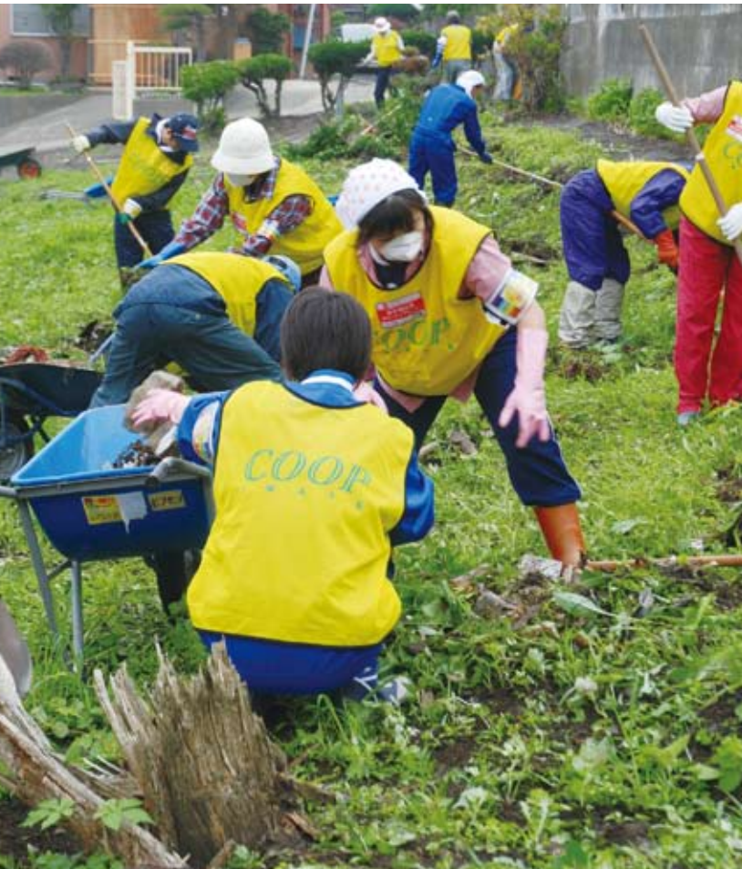
Volunteer work called for by the CVC of Iwate Co-op. Removing debris involves both work that requires heavy machinery, as well as work that can be done by the hands of the volunteers.