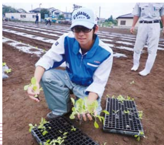
On September 11, more than 3,000 seedlings of Sendai Hakusai Cabbages were planted on a field in Natori City. The seedlings were cultivated by agricultural high school students in Miyagi Prefecture.