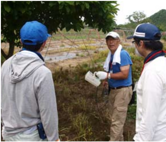
Volunteers helped with radiation decontamination in order to protect the health of people living in the area for a long period of time.