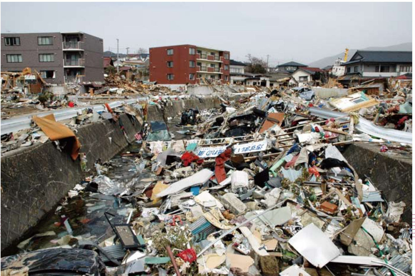
Central area of Ofunato City in Iwate Prefecture affected by the tsunami.

comprehend the situation, despite being cut off from all manners of communication. Isolated stores and branch offices began moving forward on their own toward recovery. Employees of Co-ops nationwide also began hastening to the disaster areas to provide assistance.