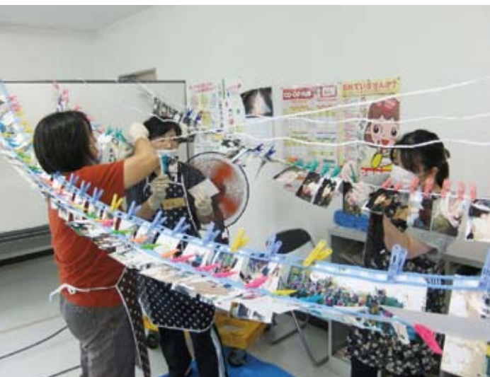
Photos gathered from Yamada Town in Iwate Prefecture hanging on the line to dry after washing. Some people commented that they “didn’t realize how important photos were until now.”

living in the disaster areas to visit them in their area, so that they can rest and recuperate. This showed a new way to continue supporting to the people affected by the disaster, despite the distance.