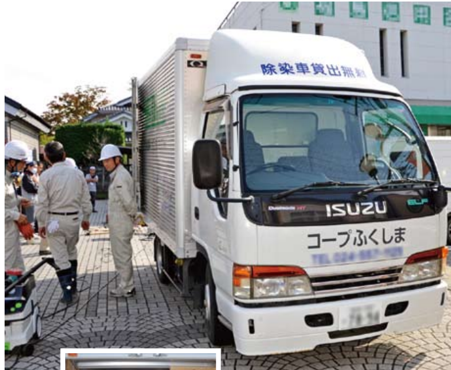
Co-op Fukushima's radiation decontamination car.