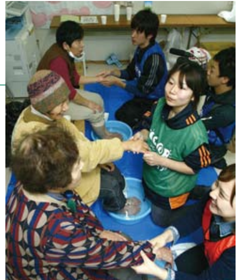
In November, Co-op Ishikawa provided footbaths and massages to those in temporary houses of Rikuzen Takata City in Iwate Prefecture to warm their body and soul.

Because of the enormity of the disaster spanning a great distance, the recovery effort requires much time with the help of many people. Co-ops employees and members nationwide actively conducted volunteer activities. Their work was not only confined to within the Co-op organization, but also reached out to connect and work with other organizations.