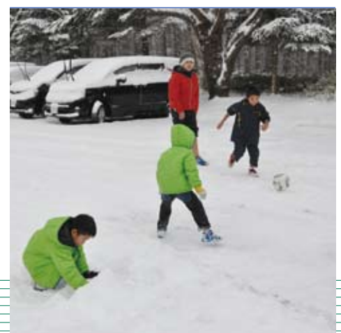
"Snow!" Children playing despite their wet shoes. ("Fukushima no Kodomo Hoyo Project (Fukushima Children Protection Project)")