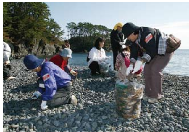
39 participants of the recovery tour hosted by Co-op Aichi cleaned Goishi Kaigan beach (Ofunato City) and visited people living in temporary housing, delivering 230,000 towels to the people.

On November 26, the Saitama Co-op and Co-op Fukushima jointly hosted the “Fureai Cafe” at the temporary housings in Minami Soma City, Fukushima Prefecture.