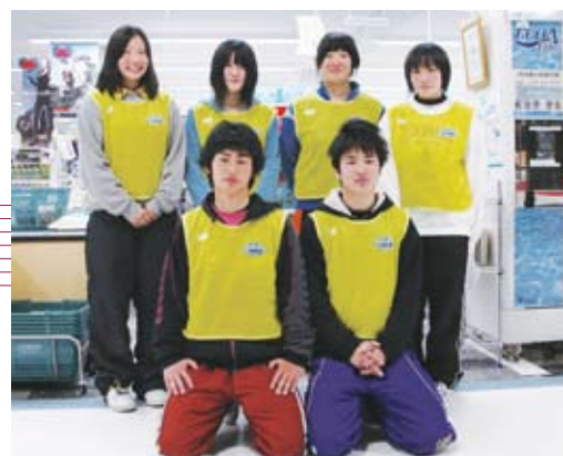
After the disaster, high school students actively volunteered at the Iwate Co-op / Marine Co-op DORA.