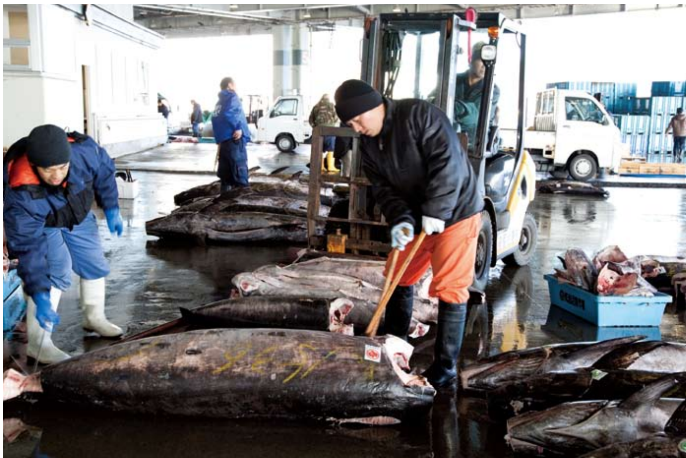
Half of the market in Kesenuma City of Miyagi Prefecture has resumed operations (as of December 2011). Recovery efforts for Kesenuma City are being made centered around this market.

* Sanchoku is a Japanese word translated as direct transaction or direct buying routes from producers to consumers.