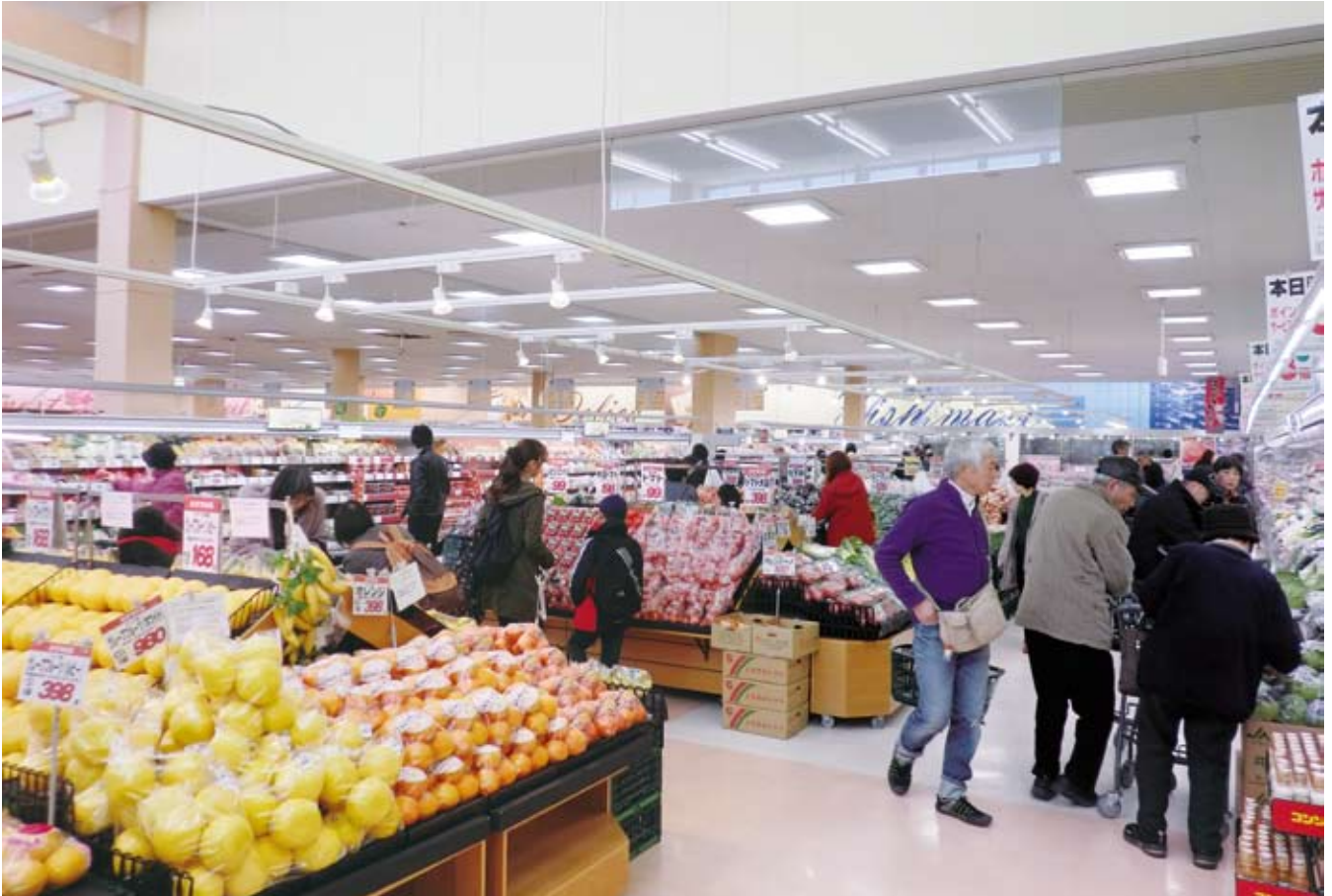
On April 1, Miyagi Co-op Akashidai Store (Tomiya Town) was able to resume almost normal operations. The store floor again began offering colorful selections of a variety of items.

and individual delivery services aimed to resume these functions. Not to be forgotten is the fact that these employees, working to realize these goals, were themselves victims of the disaster. It was the start of rebuilding the business from a long-term perspective.