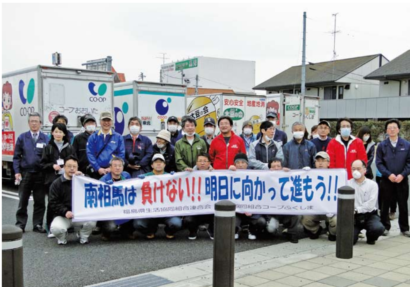
Co-op employees who gathered from all around the nation to support the recovery efforts helped with the event “Makenai Minami Soma City (Minami Soma City will Not Be Defeated).”

out. Products determined to be safe were still affected by negative rumors, adding to their difficulties. Local and nationwide Co-ops are working to support the people who live in these areas in a state of uncertainty, even today.