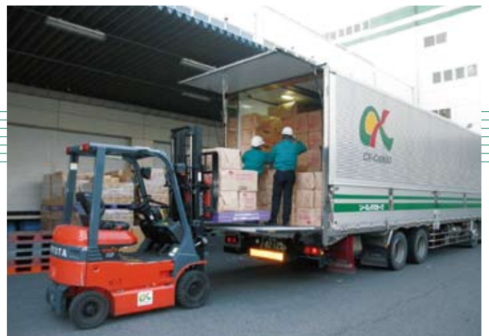
A truck being loaded with supplies for the disaster areas at Okegawa DC of CX Cargo.