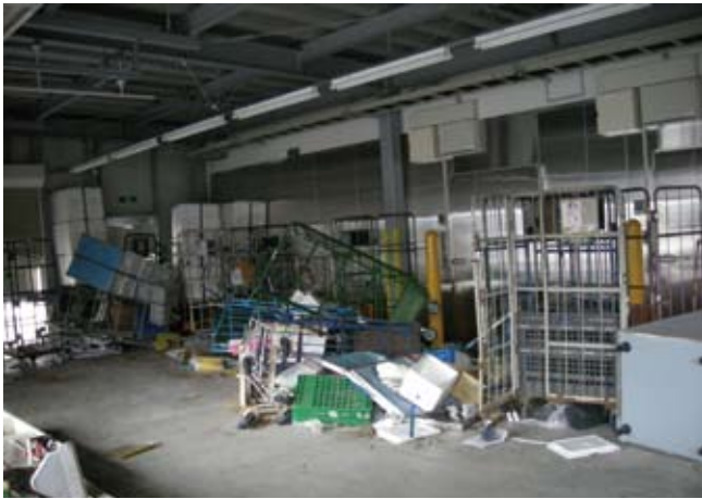
Iwate Co-op Kamaishi Home Delivery Center, newly built on November 2010, was also heavily damaged by the tsunami.