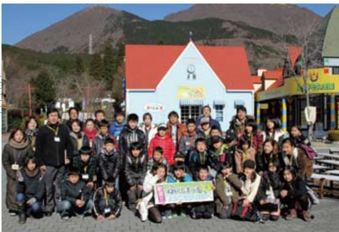
Fukushima kids visiting Oita Prefecture.