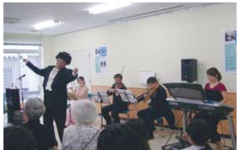
Music concert held at the Miyagi Co-op / Hebita Store.