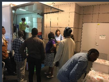
Consumer coop delivery service