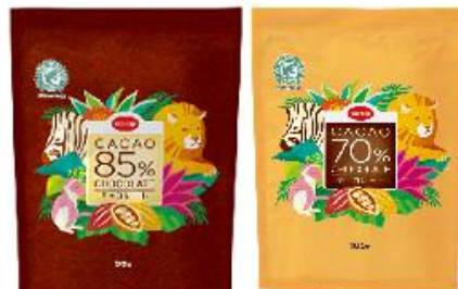
(R) CO·OP cacao 85% chocolate (L) CO·OP cacao 70% chocolate

The new release items are on sale nationwide at co-op stores and home delivery outlets.