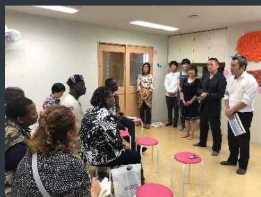
Worker coop members at a childcare facility

The link below shares the views of the participants about the study tour especially how the experience got could lead to the improvement of their cooperative businesses after returning home.