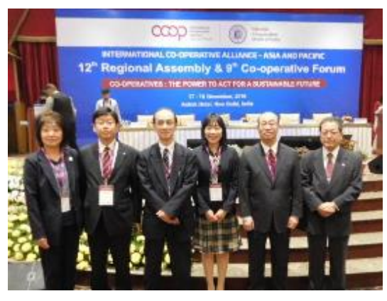
Japanese participants in the ICA-AP General Assembly

JCCU will continue to contribute to the development of co-operatives in the Asia-Pacific region.