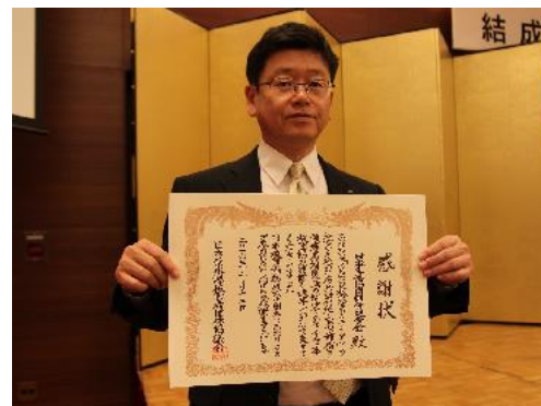
Letter of appreciation from the Japan Hidankyo