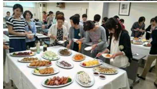
Scene of food tasting