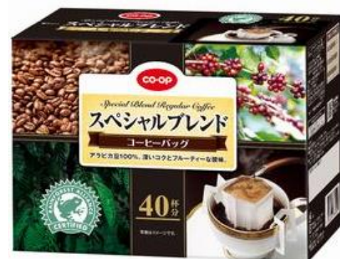
CO-OP special blend coffee bag