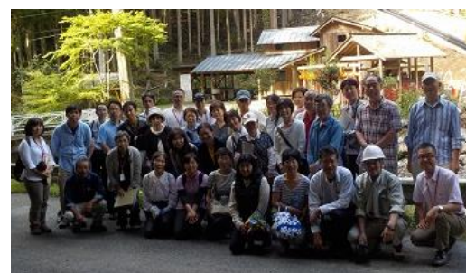
Participants pose for a group picture after the tour