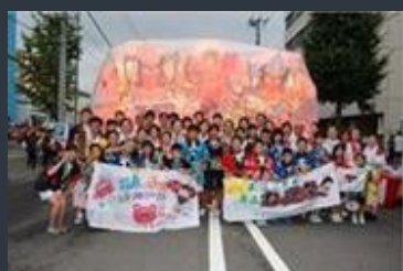
State of this year's summer vacation program