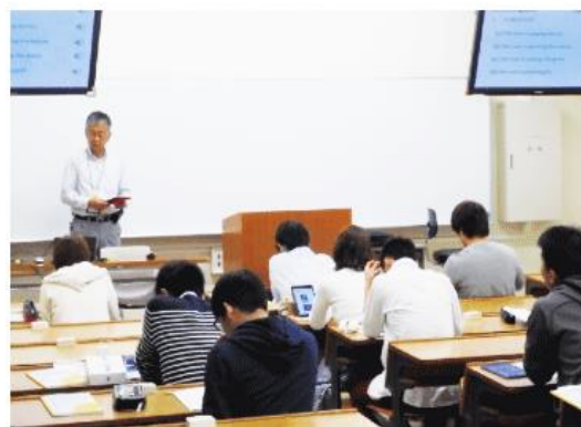
Scene of university class utilizing electronic textbook

The viewer can be used on devices such as iOS, Android, Windows and MacOS.