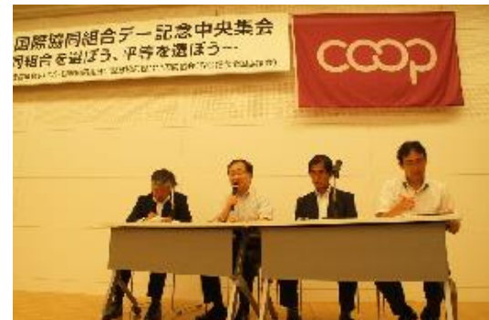
Scene at the panel discussion