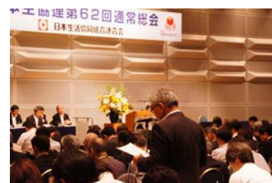
The entire state of the discussion