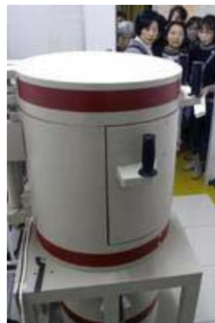
Germanium Semiconductor detector

Inspection will lead to raising members confidence in the products.