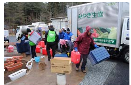
Supply of kerosene

This service, which started in November last year by Co-op Tohoku Sunnet Federation supplies 18 litres of kerosene only once to each household.