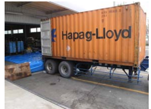
Kerosene delivery truck

On March 22, the first aid 'kerosene' from Co-op Kobe arrived at Miyagi Co-op HQ in Sendai.