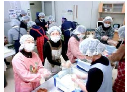
Members of Iwate Co-op making rice balls

On March 22, the first aid 'kerosene' from Co-op Kobe arrived at Miyagi Co-op HQ in Sendai.