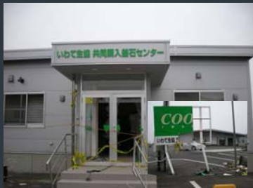
Iwate Co-op (Home delivery center)