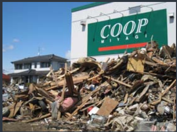
Devastated Co-op store