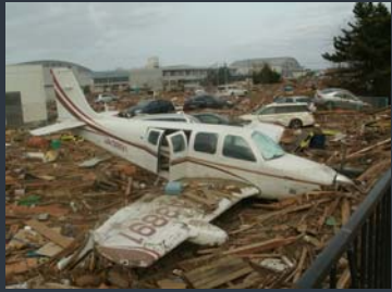
Scene at the Sendai Airport