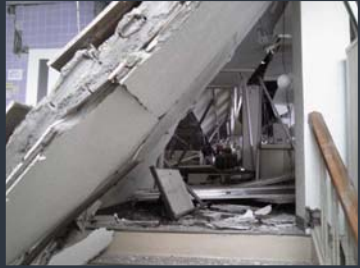
Miyagi Co-op building collapse