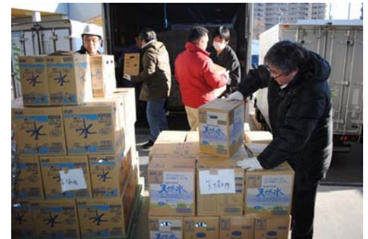
Supplies loading process