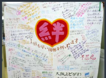
Message from Osaka Yodogawa Co-op to sufferers in the stricken area