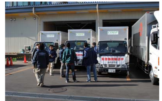
Loaded trucks ready for delivery